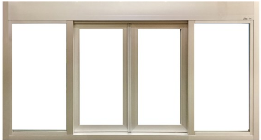
606-80 shown with clear anodized frame